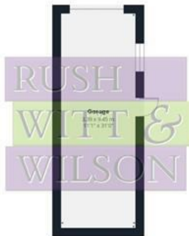
Floor 0 Building 3